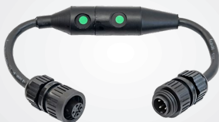
Break Away Connector