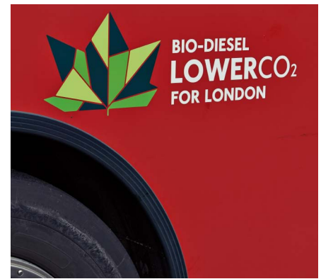
Honeywell Enraf's Fusion4 Microblender helps reduce bus emissions in London.

Scalable and versatile, Fusion4 brings intelligent features and powerful functionality to loading, blending and additive injection operations. It allows terminal operators to continuously control and monitor system performance.