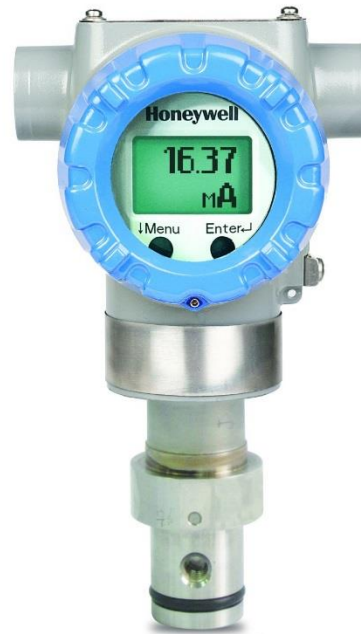
Figure 1 – STG73SP Flush Mount Gauge Pressure Transmitters feature field-proven piezoresistive sensor technology