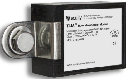
Scully Truck Identification Module ®