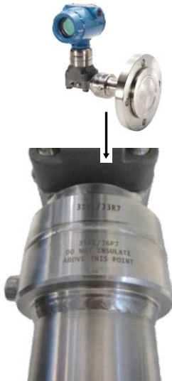
Figure 2. Thermal Range Expander System Insulation Considerations

The Thermal Range Expander System uses the heat from the process in order to keep both fluids within the system functioning properly, therefore insulation is not always required. However, it is always best practice to insulate systems to keep them functioning with optimum performance. The Thermal Range Expander should never be insulated above the line marked on the seal itself, see the figure below for reference.