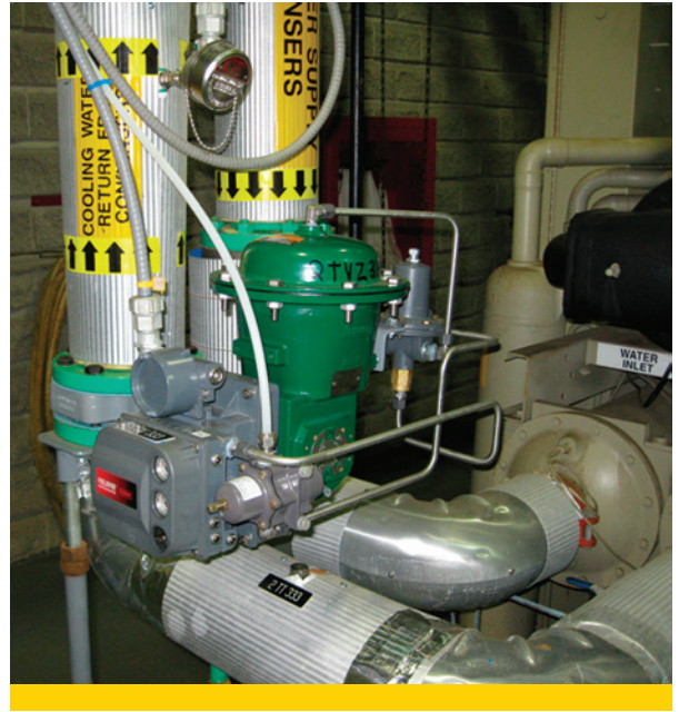
The two new Control-Disk valves installed at CAMECO include Type 2052 actuators and FIELDVUE™ DVC6020 digital valve controllers with Advanced Diagnostics.

“The Control-Disk valves worked well, even before they were fine-tuned,” said Jonathan Smith, a process engineer at the Blind River plant. “We have tried competitors, but we always return to Fisher valves.”