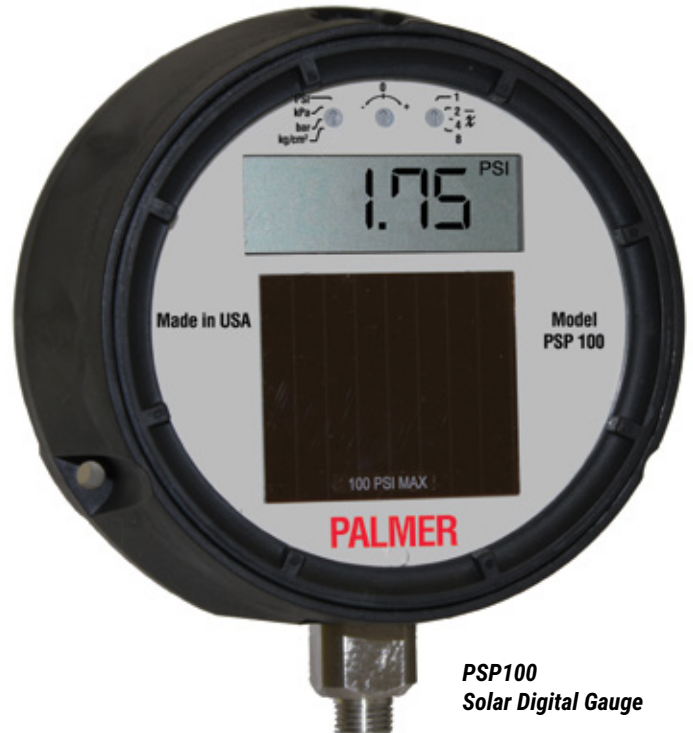
PSP100 Solar Digital Gauge